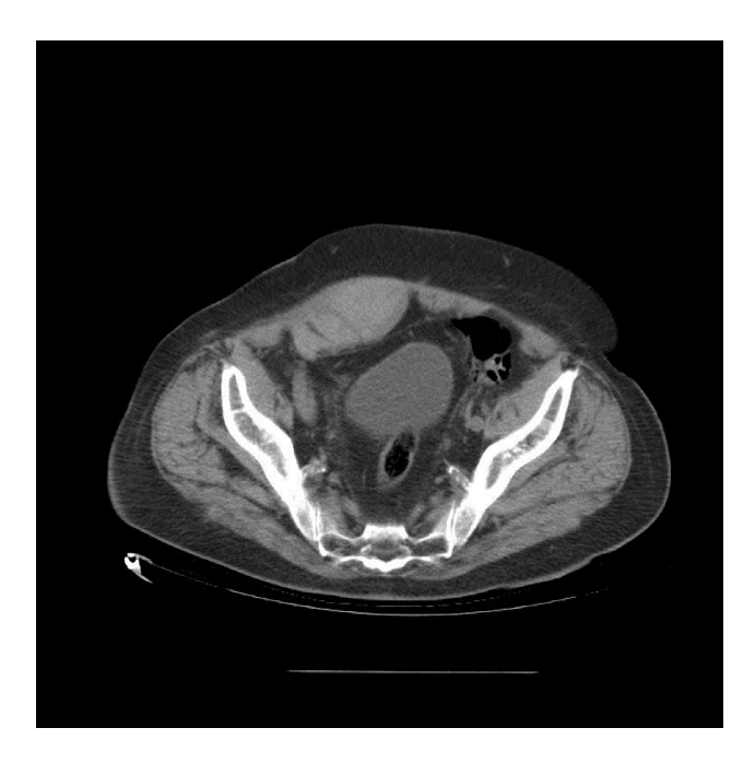
Fig 2. Right rectus sheath haematoma

In a recent study on 78 patients, the extension of rectus sheath haematoma below the "arcuate line" and the number of blood transfusions required has been correlated to a potential higher risk for hemodynamic instability and mortality. Although no statistically significant prognostic risk factors of haemodynamic instability could be identified, the authors believe that a large haematoma can be predictive of haemodynamic instability.