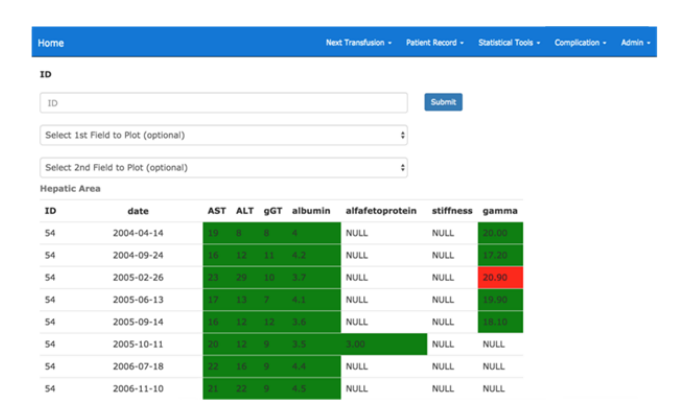
Fig. 4. Summary picture for the kidney area related to a patient with chronic kidney disease.

The system also provides for the possibility of showing summary dashboards divided by area (liver, cardiac etc.) containing the most significant coloured parameters according to the belonging range and the display of alert messages in the case of values higher than the critical thresholds established in relation to the patient's pathology and characteristics (gender, age etc ..). Figure 4 shows an example of a summary picture for the kidney area related to a patient with chronic kidney disease.