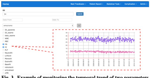
Fig. 3. Example of monitoring the temporal trend of two parameters (Hb and Ht) related to the blood count of a generic patient.

This decision support system also allows the clinician to explore patient data or suitably clustered patient groups, selecting the parameters to be monitored and the type of representation (which can for example be graphic / tabular). Figure 3 shows an example of monitoring the temporal trend of two parameters (Hb and Ht) related to the blood count of a generic patient.