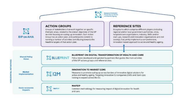
Figure 2. The structure of the European Innovation Partnership on Active and Healthy Ageing

The modalities to cooperate to the implementation strategies of the EIP on AHA are: 1) to become a Reference Site; 2) to take part to the Action Groups.