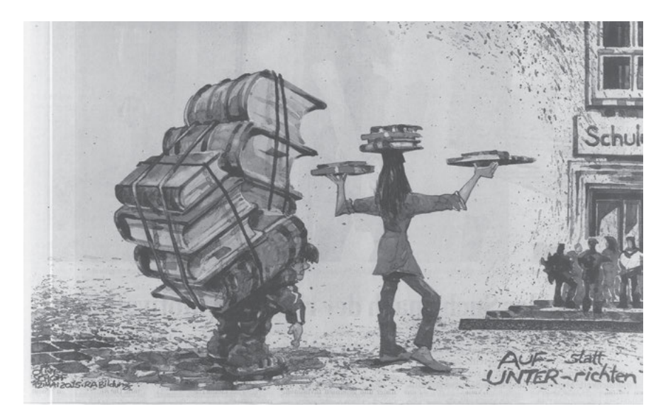
Figure 10.2: The burden of knowledge? - "Der Standard" (may 12, 2015).

topic "historical competence for social orientation"<sup>16</sup>; in German, this is called historische Orientierungskompetenz . This means that history should enable learners to orient themselves in a confusing world. Therefore, the title of these teaching materials is Geschichte nutzen ; in English: "to use history". In order to avoid misunderstanding: Without a doubt, the teaching materials are innovative and offer good ideas for history lessons. But we also find the mentioned problem of loose fragments. An example illustrates this<sup>17</sup>: One proposal for teaching deals with different forms of strikes. Inter alia, three pictures have to be compared. For this, only a small text box with working knowledge is provided. At least the image analysis must, inevitably, remain superficial. Therefore numerous questions remain unanswered. For example, what goals were pursued with strikes in the nineteenth century? What was or is the function of street barricades? In short: