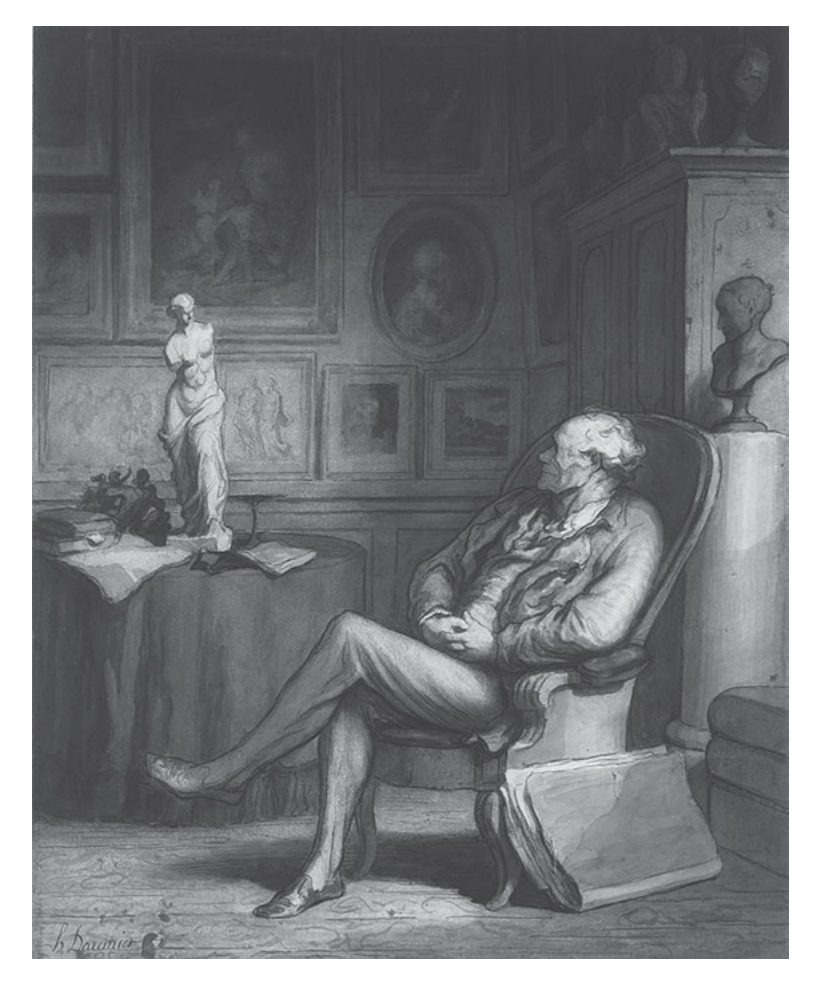
Figure 10.3: "Le Connaisseur" (Honoré Daumier, 1860–65, Metropolitan Museum of Art, New York, H. O. Havemeyer Collection).