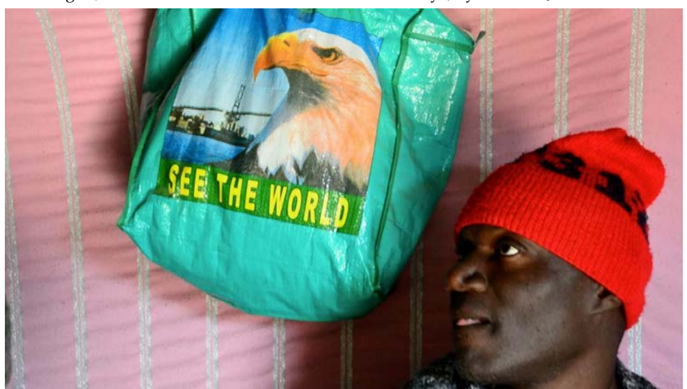
Image 2, Still from video film "The horizon is far away", by Kimbal Quist Bumstead