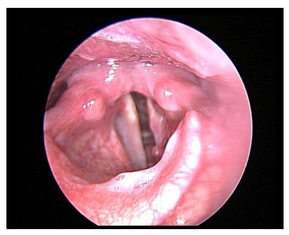
Fig. 3 - Pathological vocal cords

Then, the instrument was introduced past to the soft palate and subsequently the vocal cords were visualized. The patient was invited to phonate "I" to allow visualization of vocal cords mobility, making note of incomplete abduction, adduction.