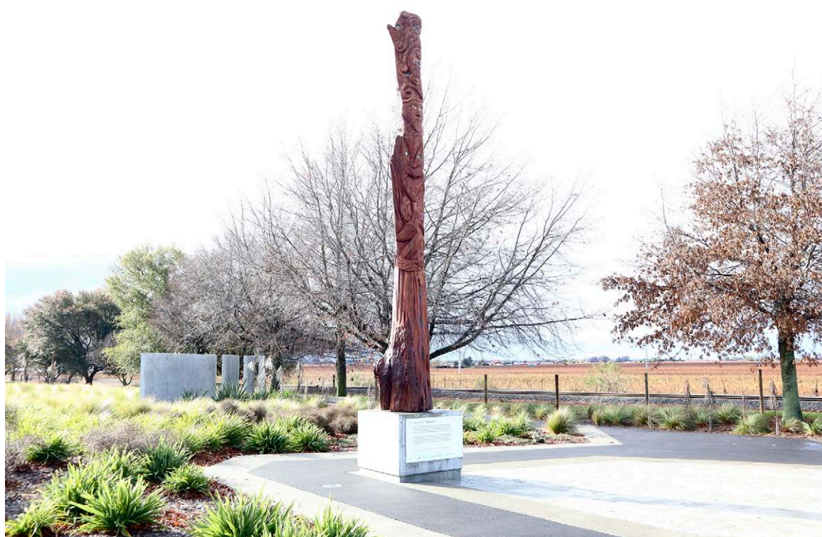
'Kei Puta Te Wairau'.