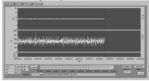
Fig. 2. Front panel of the software. The software realized with LabView displays incoming data from the circuitry; both the 500x and 5000x amplifications of the signal are displayed. When needed, a marker can be added for relevant events. Data are stored in a file selected when starting the software.

integrated microprocessor provides DAC function and link to a PC through a USB port. See text for other details.