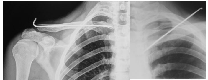
Fig 3: Xray shows a K-wire fixation on middle third clavicle fracture and the migration of K-wire.