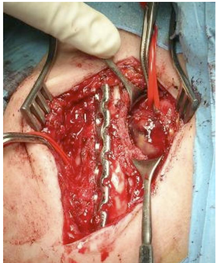
Fig 5: Intraoperative view of pseudo-aneurism of subclavian artery.