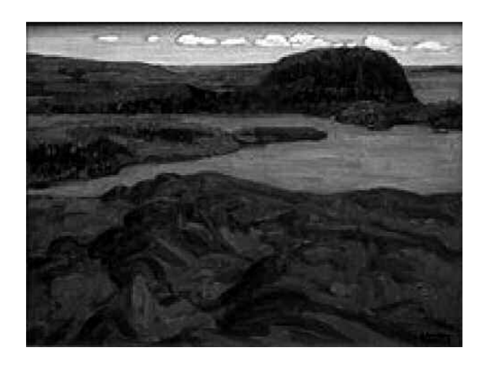
FIGURE 3 Lawren Harris, Pic Island , 1924; oil on canvas, 123.3 x 15.9 cm, McMichael Canadian Art collection, Kleinsburg, Ontario, Canada.