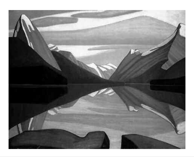
FIGURE 4 Lawren Harris, Maligne Lake, Jasper Park , 1924; oil on canvas, 122.8 x 152.8, National Gallery of Canada. Ottawa. Ontario, Canada.

A landscape is the representation of a space which the eye can view at once. It also represents an image torn away from the earth. Landscapes sub-