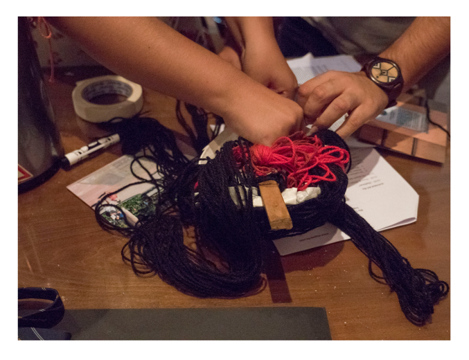
Figure 1: The assembling of Lautaro's head during the site-specific workshop in the Plaza de Armas.

Notwithstanding the felt power of the gesture, nothing remarkable happened immediately afterward: people did not seem to notice, confirming the common joke that the sculpture is mostly used as a bench. What was noticed instead was another improvisation by part of the group, on another side of the square, this time focusing on the statue of Pedro de Valdivia, the conqueror, by hanging a list of questions at the feet of the statue's horse. The police intervened almost immediately, asking who we were, what we were doing, and why, and insisting, even after we explained that this was an artistic project, that political actions in the area required special permits. They left after registering mine and Roberto's details. The workshop ended shortly after the interruption of this improvisation. Lautaro's head,