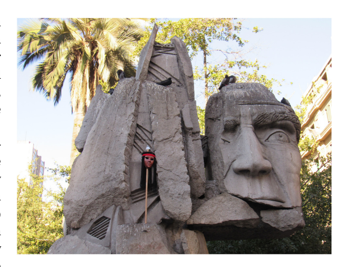
Figure 2: Lautaro's head placed on top of the Monumento en homenaje a los Pueblos Indígenas © Roberto Cayuqueo Martínez.