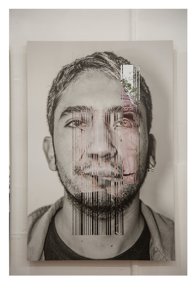
Figure 5: "Cabeza de Indio" by Antil, detail.

of the place and of the monument itself. Similarly, as noticed by Marie Juliette Urrutia Leiva, the very material features of the Monumento make it impossible to represent the "recomposition" it is deemed to convey as one figure resuming on itself diverse ways of being indigenous. In Marie Juliette's words, the Monument ends up doing exactly the opposite: reproposing a "fragmented Indian" traversed by many violent ruptures. The layering of features and materials evident in the final images elaborated by Antil responds to this idea of fragmentation and impossible recomposition, making visible the tensions traversing the monument and the square. Thinking with Jacques Rancière, in what the author has famously defined as "the distribution of the sensible," this artwork actively participates in the redefinition of the relationship between what is visible, thinkable, and audible, and what is not.<sup>27</sup> Through the exploration of political aesthetics and imaginations, perceived elements of reality are shuffled and re-arranged in ways that reconfigure the very relationship between the possible and the impossible, crafting spatialities and temporalities that allow for the emergence of alternative narratives.