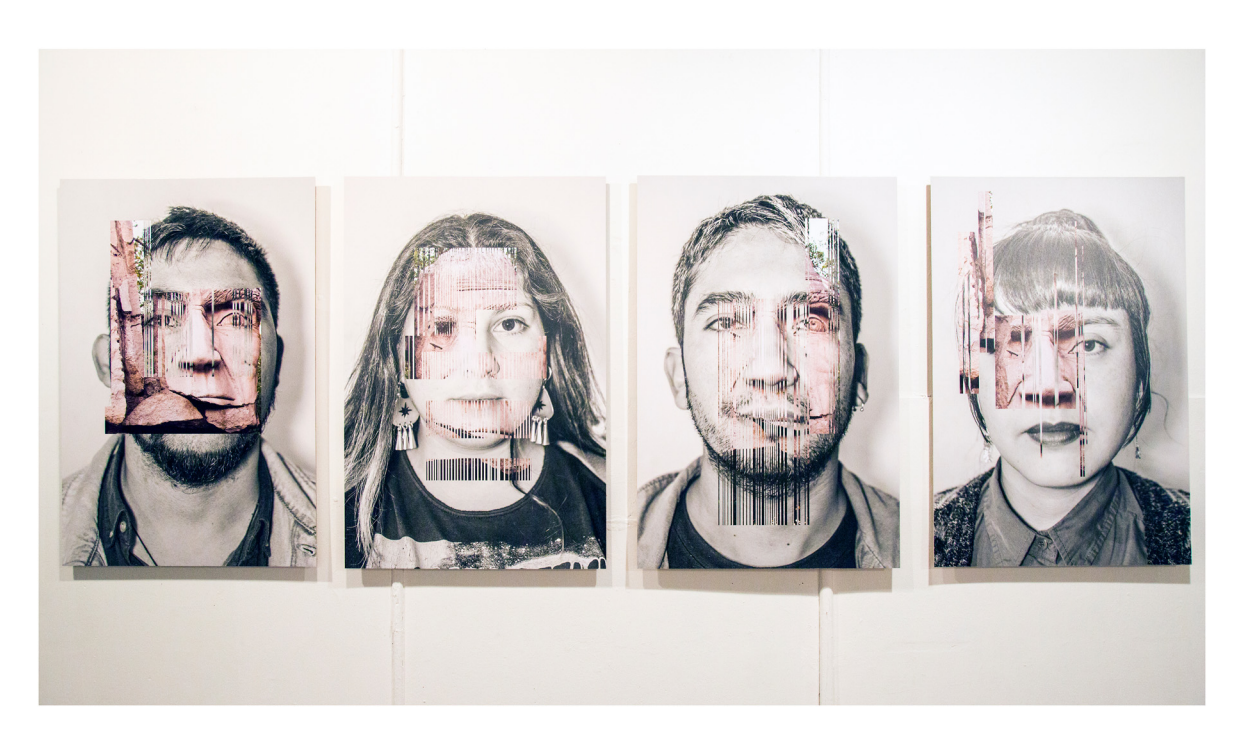
Figure 4: "Cabeza de Indio" by Antil, detail.