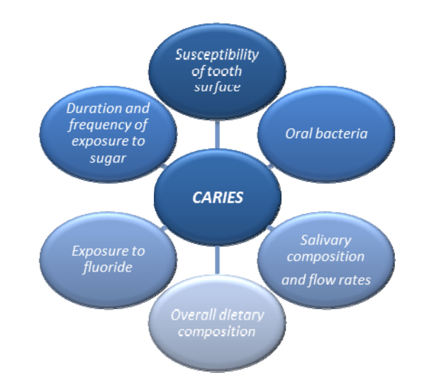
Fig. 2.Dental caries: a multi-factorial disease

They are found in large quantity in dental plaque. The tooth surface normally loses some tooth mineral with the action of the acid formed by bacterial plaque after ingestion of foods containing fermentable carbohydrates, which is the first step in the development of carious lesions.