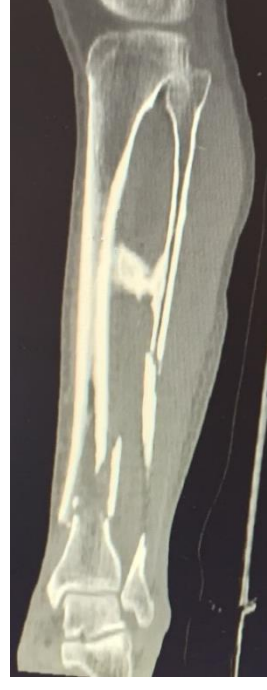
Fig. 1 X--ray left leg shows 42 B1.2 leg fractures