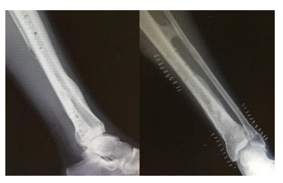
Fig. 6 X-ray shows the removal of plates and screws after 1 year from the injury