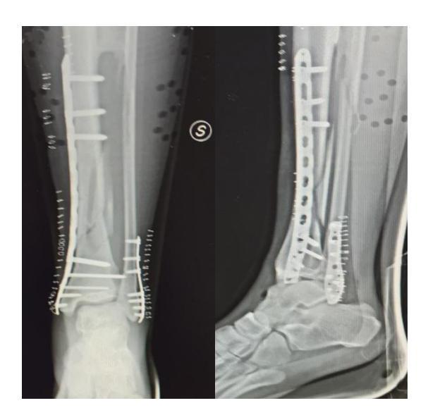
Fig. 4 X-ray shows the final osteosynthesis

Type III Synostosis at a more distal level than type II and marked bowing of fibula which occurs throughout its length with increased interosseous distance occurring into the distal half.