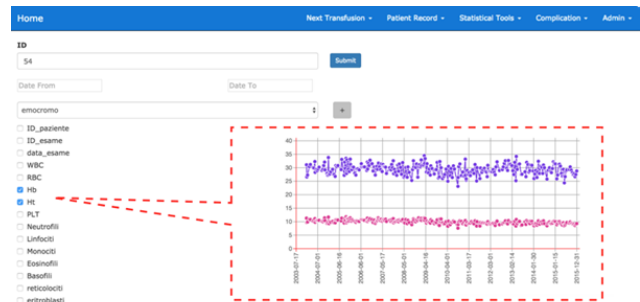
Fig. 3. Example of monitoring the temporal trend of two parameters (Hb and Ht) related to the blood count of a generic patient.

This decision support system also allows the clinician to explore patient data or suitably clustered patient groups, selecting the parameters to be monitored and the type of representation (which can for example be graphic / tabular). Figure 3 shows an example of monitoring the temporal trend of two parameters (Hb and Ht) related to the blood count of a generic patient.